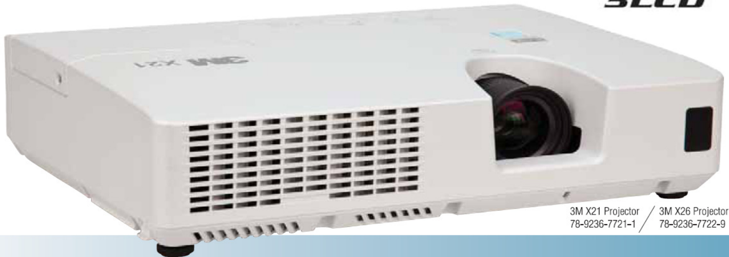
3M X21 Projector / 3M X26 Projector 78-9236-7721-1 / 78-9236-7722-9