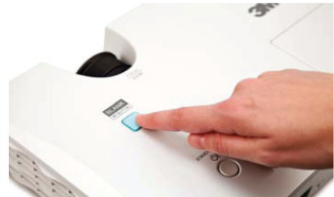
With 'My Button' the presenter can instantly blank the screen

Adjustable height extension 78-6969-9698-8