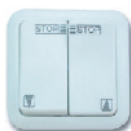
Mechanical Wall Switch